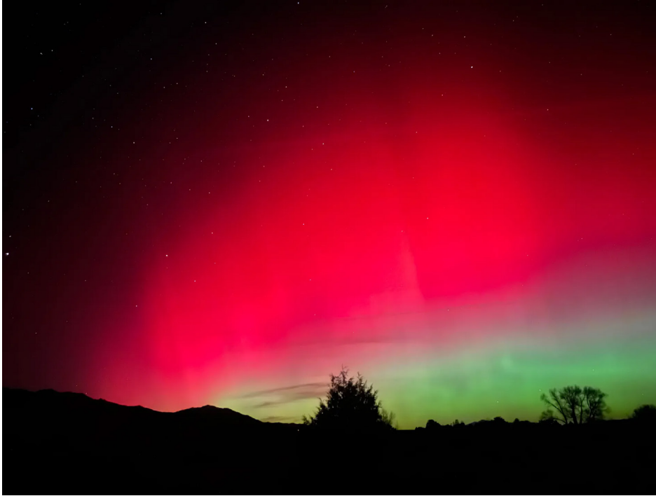
The aurora borealis photographed from Salida, Colorado, on November 11, 2025. The aurora was visible as far south as Los Alamos, New Mexico, though the green curtains seen here were only visible farther north.

stream of charged particles called the solar wind , and when that wind strikes Earth's magnetic field, it blows the field into a long tail on the planet's nightside. In the 1960s, when the Vela satellites crossed this magnetotail near the geomagnetic equatorial plane, they detected a pronounced peak in energetic electrons. In the center of the tail, where Earth's stretched magnetic field lines flatten and weaken, the Vela instruments revealed a dense sheet of plasma where charged particles collect: the plasma sheet, through which most of Earth's space weather flows.