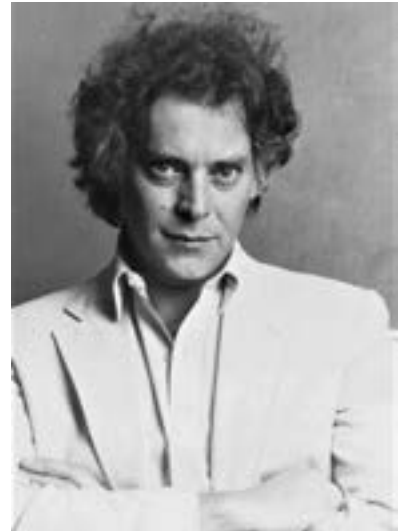
Mitchell Feigenbaum, photographed years after his Los Alamos work, whose discovery of universal constants revealed how nonlinear systems transition to chaos.

Chaos , in the scientific sense, isn’t randomness or disorder. It is deterministic unpredictability. As many nonlinear systems are pushed harder, they don’t slide smoothly into chaos. Instead, their regular behavior fractures in stages. The process, called period doubling, describes how a system that once repeated every cycle begins oscillating between two repeating states, then four, then eight, and so on. Feigenbaum noticed that each successive doubling occurred after a change in conditions about 4.67 times smaller than the one before it. Practically speaking, this meant that in short order, infinite bifurcations were squeezed into a finite range of conditions, making long-term prediction impossible. “I called my parents that evening and told them that I had discovered something truly remarkable that, when I had understood it, would make me a famous man,” Feigenbaum later recalled. He did indeed become famous in certain scientific circles. “The