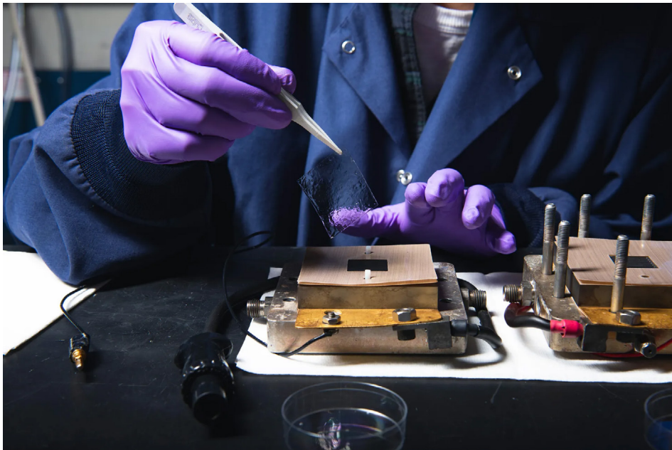
A Los Alamos–made material for the membrane of a hydrogen fuel cell that is optimized for larger vehicles.

“The DOE fuel cell program switched to heavy duty vehicles and trucks,” says Zelenay. “For trucks, batteries are not practical due to their prohibitive size and weight, but hydrogen fuel cells showed potential as an alternative solution.” In 2020, the DOE launched a consortium, co-led by Los Alamos and Lawrence Berkeley national laboratories, to advance new types of fuel cells.