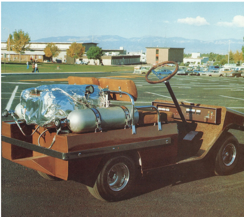
A hydrogen fuel cell golf cart made at Los Alamos Scientific Laboratory in the 1970s.

One of the challenges that faced Lab scientists was that the best catalyst was also the most expensive: pure platinum metal. The researchers set out to find a way to reduce the amount of platinum needed (or find an alternative catalyst), increase efficiency, and ensure the durability of the fuel cells.