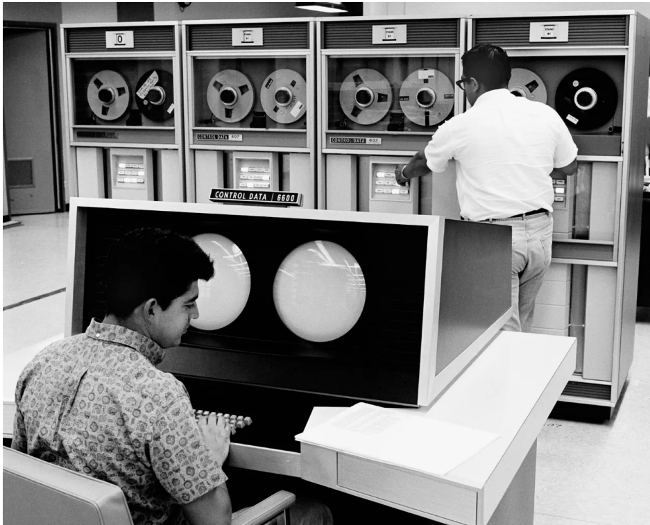
The CDC 6600 system was released in 1964 and is widely considered to be the world's first supercomputer. The Lab had four of them, making Los Alamos one of the first sites on Earth to compute large-scale numerical simulation on a true supercomputer.

studying interfaces and deformations, remain central to the Laboratory's simulations in shock physics, hydrodynamic implosion, and plasma physics. In the 1970s, Lab scientists merged Lagrangian methods with Eulerian methods, which use a fixed observation point to watch fluid flow by, producing a powerful hybrid approach to hydrodynamics computation called ALE (Arbitrary Lagrangian-Eulerian) techniques.